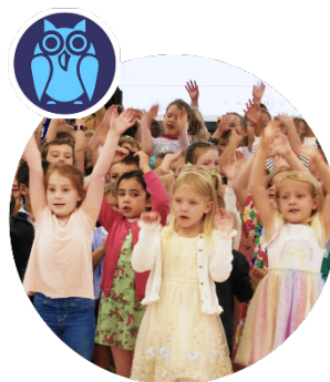
Owlsmoor Primary School