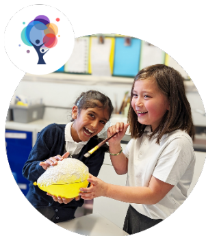
Nine Mile Ride Primary School