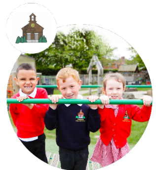
Shinfield Infant and Nursery School