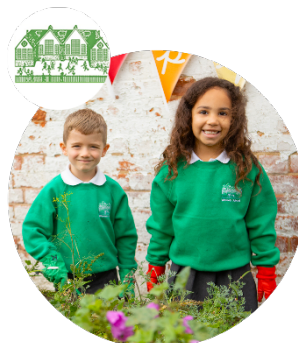
Wescott Infant School