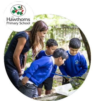
The Hawthorns Primary School