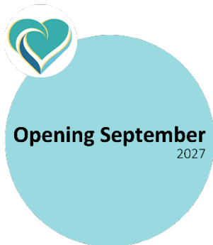
Hartland Primary School