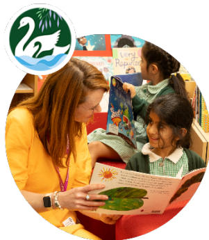
Emmbrook Infant School