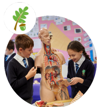
Westende Junior School