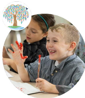
Emmbrook Junior School