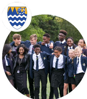
The Emmbrook School