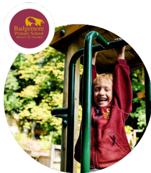
Badgemore Primary School

As a trust we are rooted in this approach and our ambition is clear; to improve the educational outcomes for children and young people. We don't want to change schools; we want to help them progress.